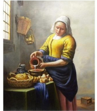
- JAN VERMEER

Platter for two 3 TYPES OF CHEESE, CRACKERS, PRESERVES, BREAD, SAUCES, PESTO, SAMOOSAS, SPRINGROLLS, BILTONG & NUTS