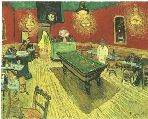
-VINCENT VAN GOGH

Platter for two 4 MEATS, SAMOOSAS, SPRINGROLLS, SAUCES, POPPERS, ONION RINGS, 2 TYPES OF BREAD, POTATO WEDGES